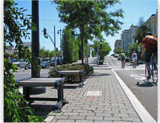
Octavia Boulevard in San Francisco was one of the handful of case studies highlighted at the workshop.

Following the case studies, participants were encouraged to write or draw their own visions for I-81. Once participants were finished drawing or writing their visions, they posted the papers on the large “Visioning Wall.”