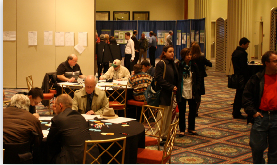
Attendees learned about the project and shared their thoughts and concerns about the future of the corridor.

to learn about The I-81 Challenge and tell us their thoughts and concerns about the future of the corridor.