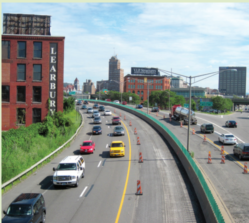
How do people use I-81? Find out in the Questionnaire Summary on our website.

Visit www.thei81challenge.org to view the questionnaire results.