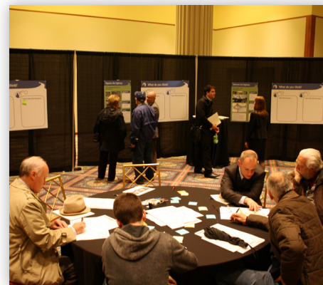
We still have a long way to go and we’ll need your continued participation!

We’ve been profoundly encouraged by the response our community has shown so far, and we will continue to build off the momentum we have created. We are charting a course for our future that few other cities in this country have done, and many will look to us as an example. Help us make sure we get it “right.”