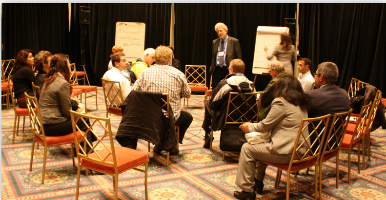
While individual ideas about the future of I-81 differ, a set of common desired outcomes has begun to emerge.

Over the past several months people have given us a diverse array of concerns, goals, and visions for the future of I-81.