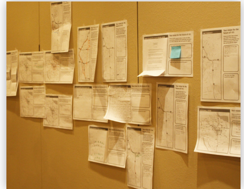
Many participants posted their ideas on the Visions Wall at the workshop.