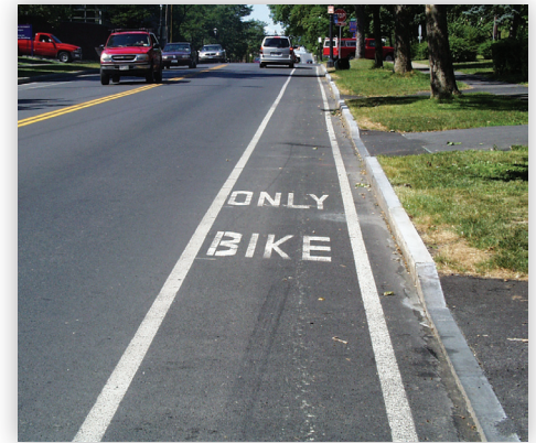
Many attendees provided ideas about transit and bicycle/pedestrian improvements.